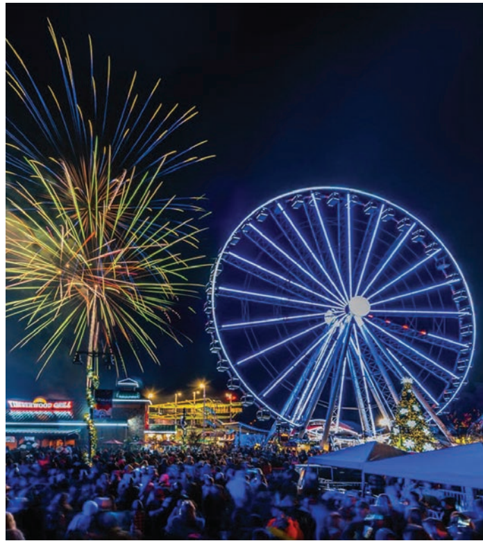
Towering 200-feet tall, the Great Smoky Mountain Wheel at The Island in Pigeon Forge is one of the tallest attractions in the Southeast.

are unpredictable. However, snow tubing is open from the Saturday before Thanksgiving through March.